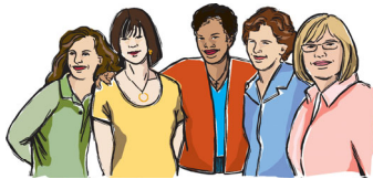
Ladies of Charity

The Ladies of Charity will meet Tuesday, December 11 at 9:30 AM in the Rectory Conference Room. IT'S IMPORTANT THAT YOU ATTEND THIS MEETING!