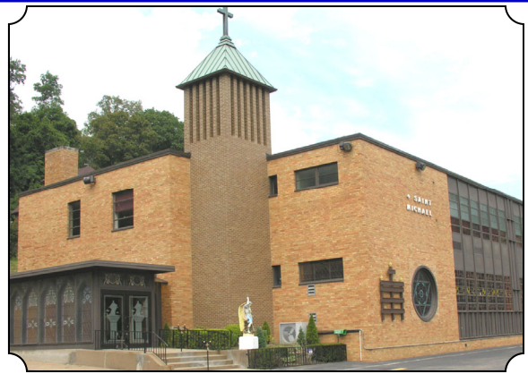
St. Michael Church 750 Wall Ave • Pittcairn, PA • 15140 412-373-2610