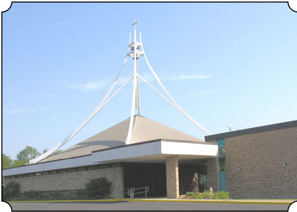
North American Martyrs Church 2526 Haymaker Rd • Monroeville, PA • 15146 412-373-0330

North American Martyrs is a vibrant parish, built on multi-generational and cultural traditions blended through the grace of the Holy Spirit. Reflecting the unconditional mercy of Jesus Christ, we as a faith community sharing God's love with all people, enthusiastically reach out to embrace everyone, especially the poor, broken, suffering and lost. We draw our strength through prayer, listening to and acting upon God's Word and celebrating the Eucharist, to foster a closer relationship with Christ as humble and faithful members of His Universal Church.