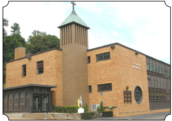
St. Michael Church 750 Wall Ave • Pitcairn, PA • 15140 412-373-2610