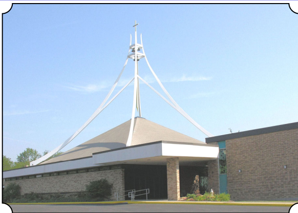
North American Martyrs Church 2526 Haymaker Rd • Monroeville, PA • 15146 412-373-0330

North American Martyrs is a vibrant parish, built on multi-generational and cultural traditions blended through the grace of the Holy Spirit. Reflecting the unconditional mercy of Jesus Christ, we as a faith community sharing God's love with all people, enthusiastically reach out to embrace everyone, especially the poor, broken, suffering and lost. We draw our strength through prayer, listening to and acting upon God's Word and celebrating the Eucharist, to foster a closer relationship with Christ as humble and faithful members of His Universal Church.