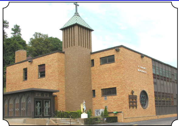
St. Michael Church 750 Wall Ave • Pitcairn, PA • 15140 412-373-2610