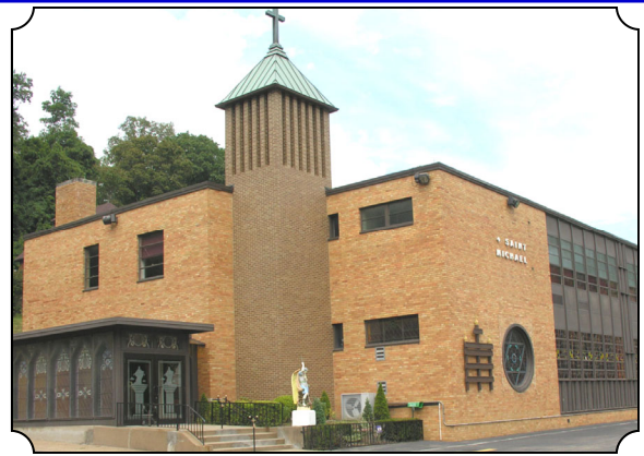
St. Michael Church 750 Wall Ave • Pitcairn, PA • 15140 412-373-2610