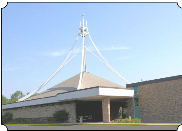
North American Martyrs Church 2526 Haymaker Rd • Monroeville, PA • 15146 412-373-0330

North American Martyrs is a vibrant parish, built on multi-generational and cultural traditions blended through the grace of the Holy Spirit. Reflecting the unconditional mercy of Jesus Christ, we as a faith community sharing God's love with all people, enthusiastically reach out to embrace everyone, especially the poor, broken, suffering and lost. We draw our strength through prayer, listening to and acting upon God's Word and celebrating the Eucharist, to foster a closer relationship with Christ as humble and faithful members of His Universal Church.