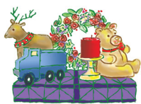
Arts &amp; Crafts Show