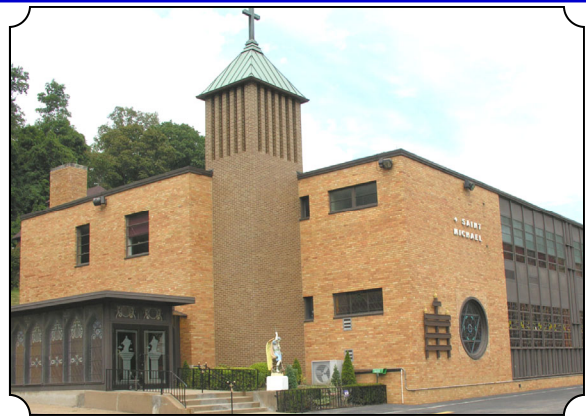
St. Michael Church 750 Wall Ave • Pitcairn, PA • 15140 412-373-2610

Office Hours Monday-Friday, 9:00 AM-5:00 PM Diocesan Victim Assistance Hotline 1-888-808-1235 Gambling assistance 1-877-565-2112