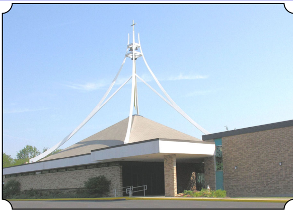
North American Martyrs Church 2526 Haymaker Rd • Monroeville, PA • 15146 412-373-0330

North American Martyrs is a vibrant parish, built on multi-generational and cultural traditions blended through the grace of the Holy Spirit. Reflecting the unconditional mercy of Jesus Christ, we as a faith community sharing God's love with all people, enthusiastically reach out to embrace everyone, especially the poor, broken, suffering and lost. We draw our strength through prayer, listening to and acting upon God's Word and celebrating the Eucharist, to foster a closer relationship with Christ as humble and faithful members of His Universal Church.