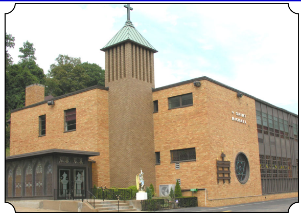
St. Michael Church 750 Wall Ave • Pitcairn, PA • 15140 412-373-2610